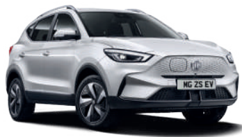
ARCTIC WHITE STANDARD PAINT