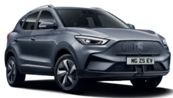
MONUMENT SILVER METALLIC PAINT*