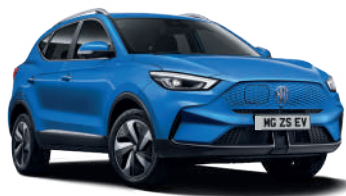
BRILLIANT BLUE METALLIC PAINT*