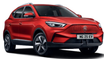
DYNAMIC RED TRI-COAT PAINT*

*Tri-coat and metallic paint optional at extra cost.