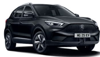
BLACK PEARL METALLIC PAINT*